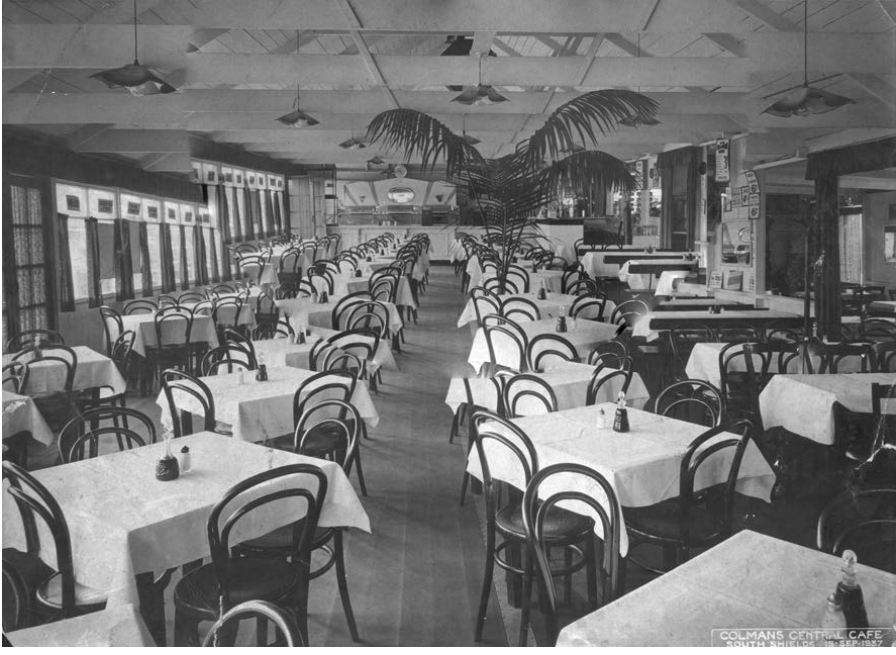
CIRCA 1925 Colman's Lido Cafe – Very swish! A palm court orchestra played light classical music on sunday afternoons.