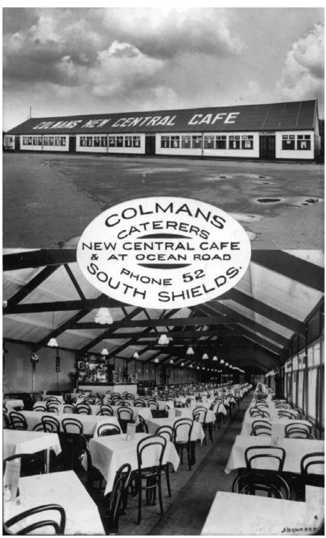
Circa 1937 Colmans Central Cafe. Unfortunately destroyed during WW2.